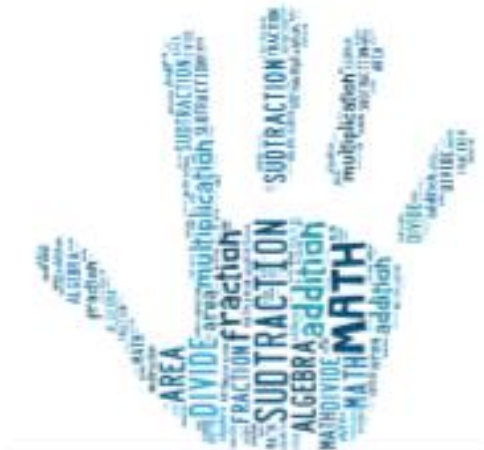
Maths words by Rixel Tumagos